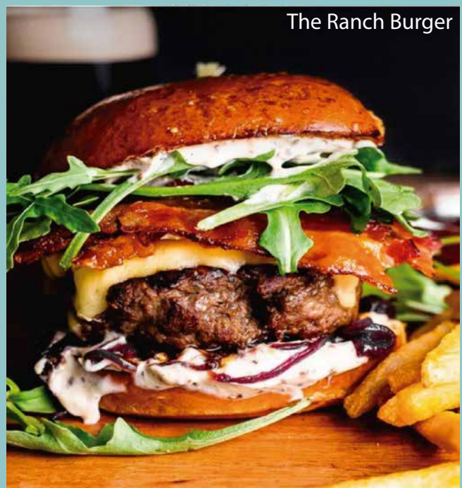
The Ranch Burger