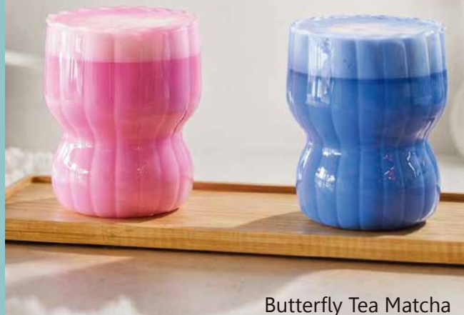
Butterfly Tea Matcha