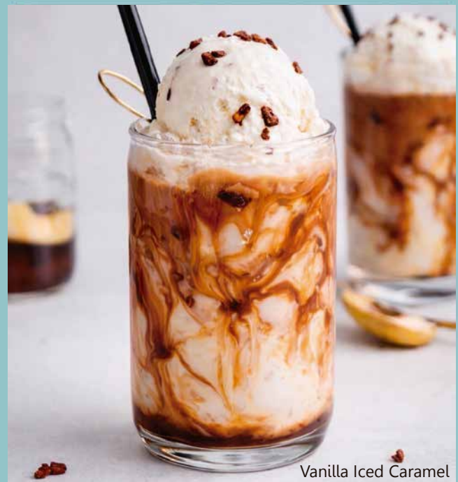
Vanilla Iced Caramel